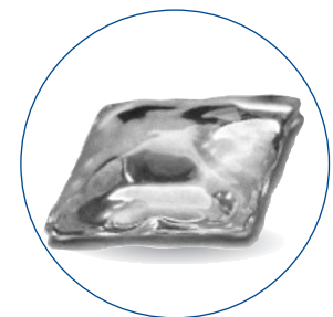
APPROX. CUBE SIZE: 1 3/8" X 1 3/8" X 5/8" THICK