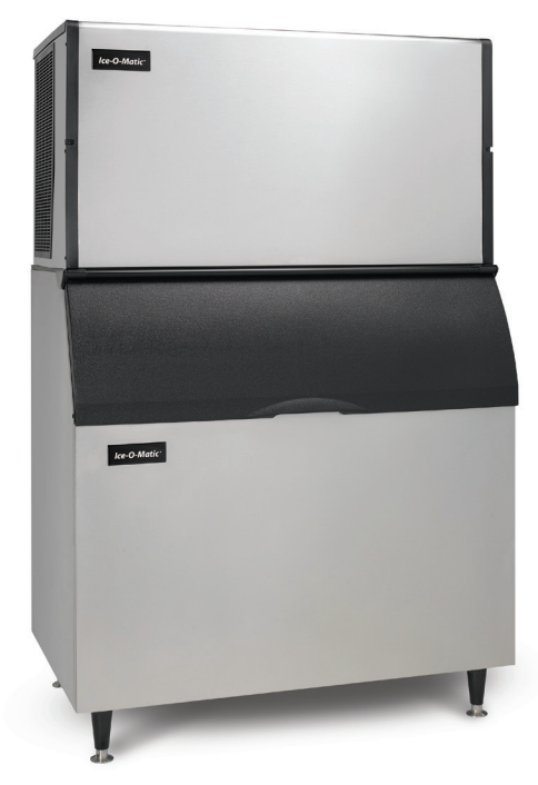
ICE2106 ON B100