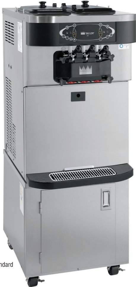
Shown with optional standard height cart.