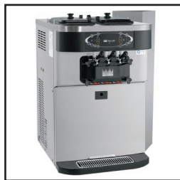
Shown with optional top air discharge chute.